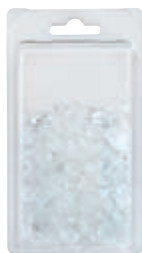
POLYPHOSPHATE CRYSTALS 6/10 (small) 160 g blister, refill TO DOSAL.